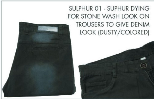
SULPHUR 01 - SUPHUR DYING FOR STONE WASH LOOK ON TROUSERS TO GIVE DENIM LOOK (DUSTY/COLORED)