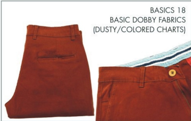
BASICS 18 BASIC DOBBY FABRICS (DUSTY/COLORED CHARTS)