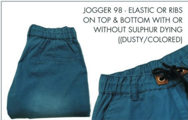
JOGGER 98 - ELASTIC OR RIBS ON TOP & BOTTOM WITH OR WITHOUT SULPHUR DYING ((DUSTY/COLORED)