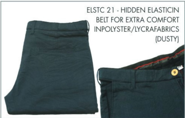
ELSTC 21 - HIDDEN ELASTICIN BELT FOR EXTRA COMFORT IN POLYESTER/LYCRA FABRICS (DUSTY)