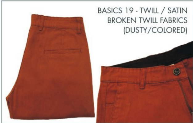
BASICS 19 - TWILL / SATIN BROKEN TWILL FABRICS (DUSTY/COLORED)

PRODUCTS ARE AS PER ONGOING FASHION ON THE DATE OF PHOTOSHOOT AND ARE THEREFORE SUBJECT TO CHANGE FROM TIME TO TIME. THESE ARTICLES ARE FOR REFERENCE PURPOSE ONLY.