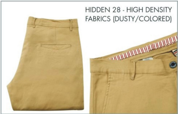
HIDDEN 28 - HIGH DENSITY FABRICS (DUSTY/COLORED)