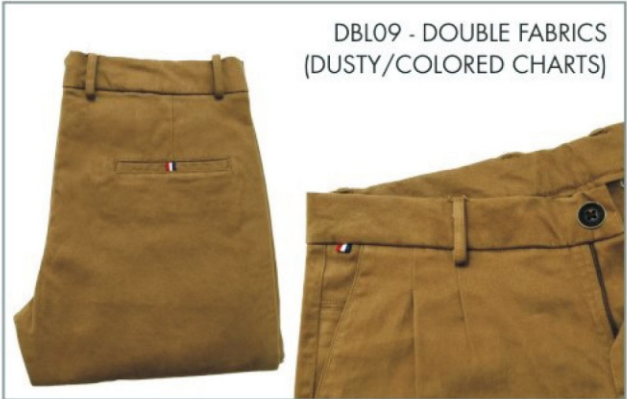
DBL09 - DOUBLE FABRICS (DUSTY/COLORED CHARTS)